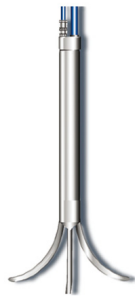
Hydraulic Borros-Type Anchors